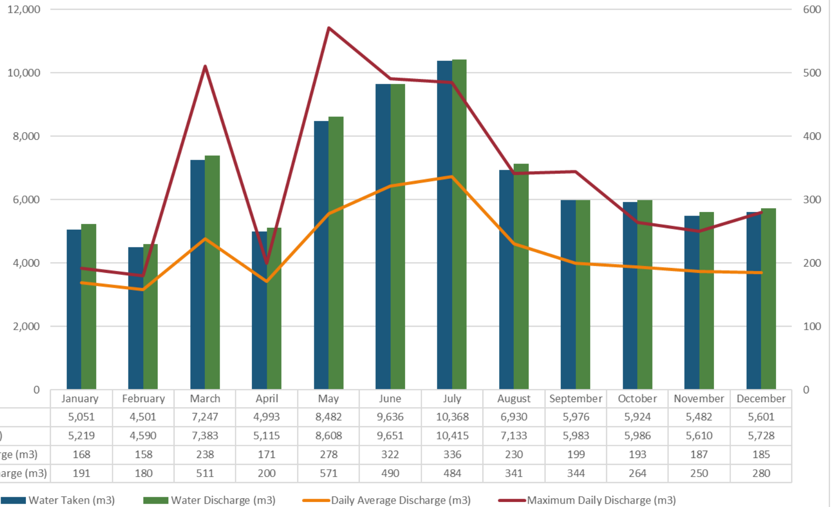
Figure 1 - Flow Quantities Grafton Drinking Water System