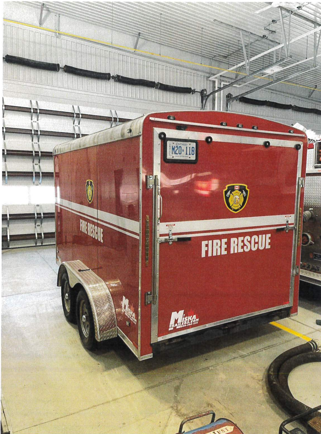
The Fire Prevention trailer was repurposed for Ice/Water Rescue operations and Wildland Fire operations.